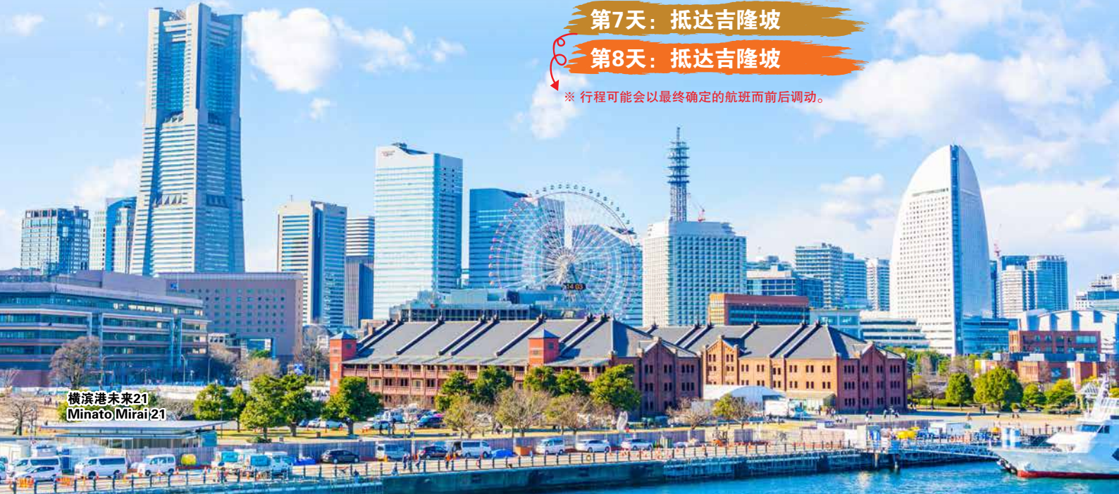
横滨港未来21 Minato Mirai 21